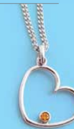
Style 003 Size approx 20mm x 14mm * in 14k white gold