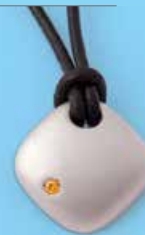
Style 002 Size approx 18mm x 18mm