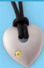
Style 001 Size approx 16mm x 16mm

Ready-to-wear pendants in sterling silver with Orange-Yellow Heart In Diamond Mini on a 16 in black leather cord or chain. ▶